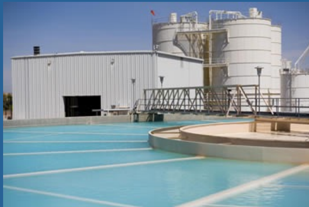
Yuma Desalting Plant Pilot Run