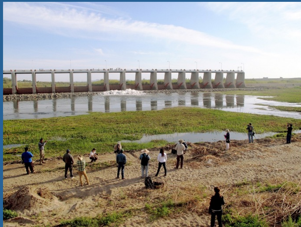
Cooperative measures through 2017