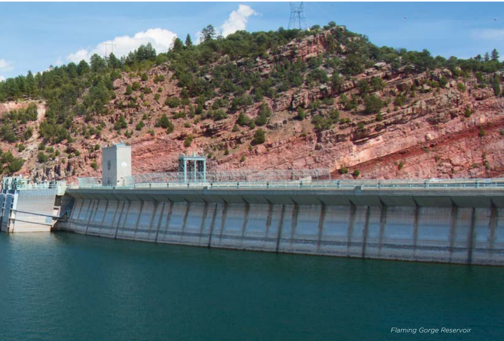
Flaming Gorge Reservoir

“Water banking” also is under discussion in Wyoming. The general concept of storing excess water in good times so it can help cover shortfalls in dry periods is essentially the same as a person’s savings account. This concept seems straightforward, but the devil is in the details relative to water law requirements, available storage facilities, costs, etc. A draft bill addressing some of these issues is currently being discussed in the Wyoming legislature. Such a bill is uncertain, but the discussion is welcome.