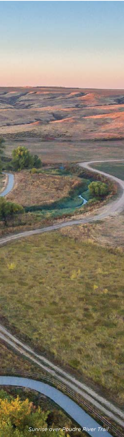
Sunrise over Poudre River Trail