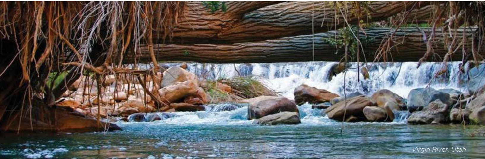
Virgin River, Utah