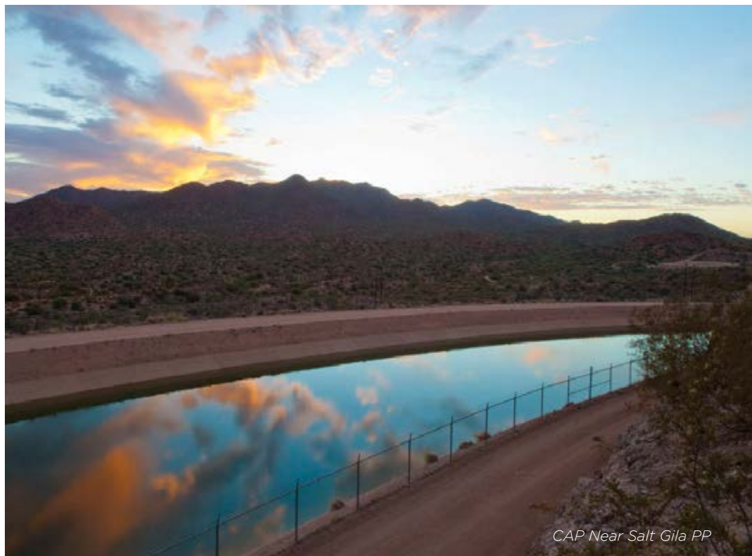
CAP Near Salt Gila PP