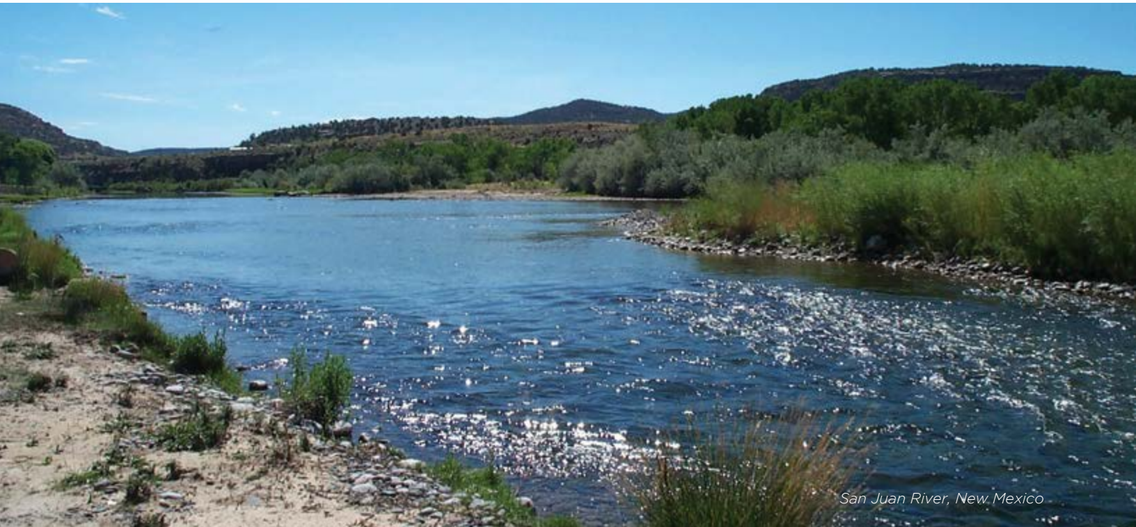
San Juan River, New Mexico