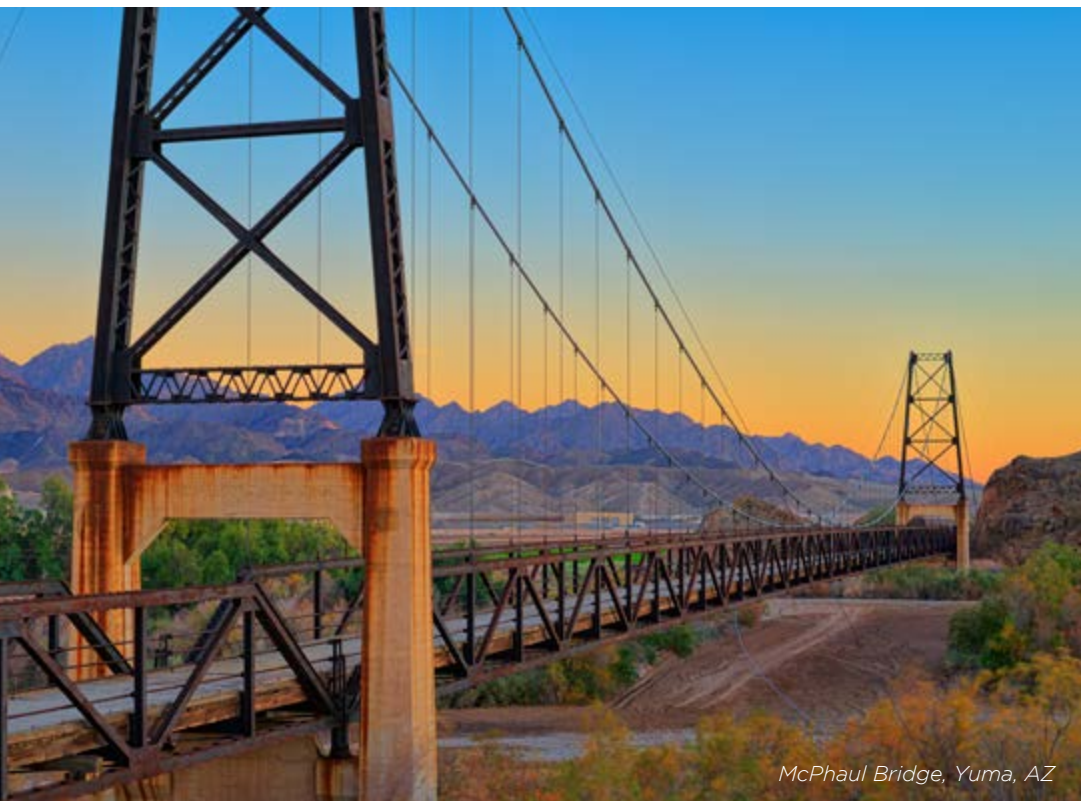
McPhaul Bridge, Yuma, AZ

SRP's constant planning for drought and conjunctive use of surface water and groundwater has allowed SRP to continue to provide adequate and reliable water to its shareholders. During the previous winter in 2017, the system experienced above-median inflows of nearly 1 million AF of runoff, increasing storage