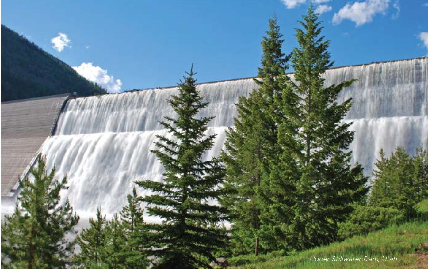
Upper Stillwater Dam, Utah