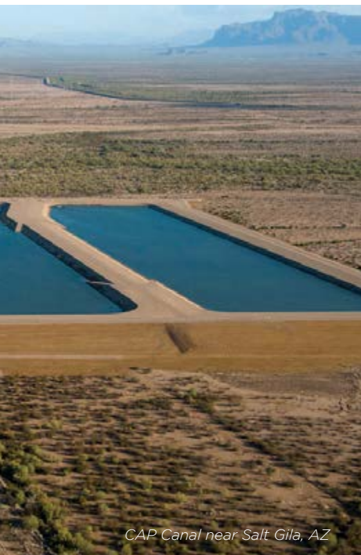
CAP Canal near Salt Gila, AZ

Data collection and analysis are ongoing, and opportunities for more efficient water and salt management outcomes will be identified. Ultimately, this data will be used to develop real-time management tools for most desert cropping systems to assist in making rotational management decisions that maximize irrigation efficiency, while precluding detrimental salt accumulations in the soil.