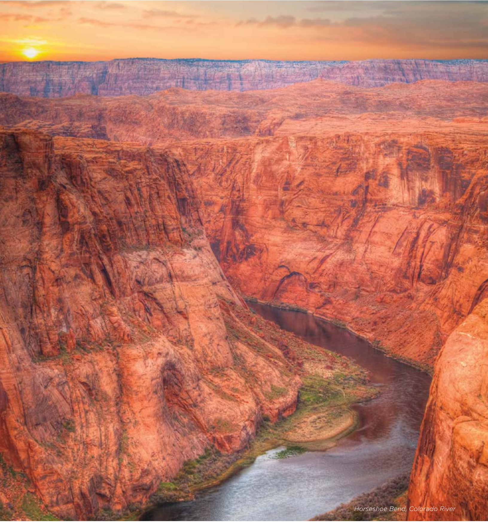
Horseshoe Bend, Colorado River