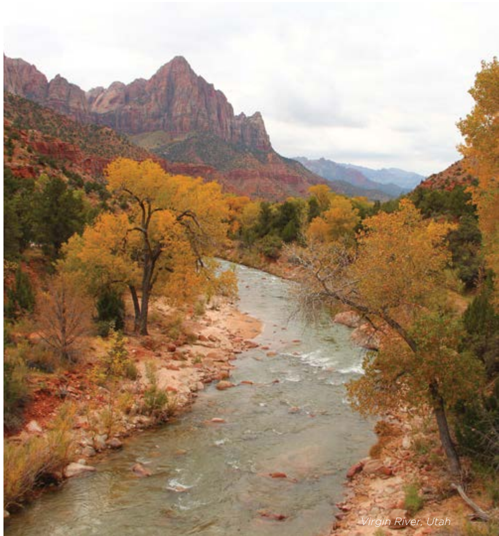
Virgin River, Utah