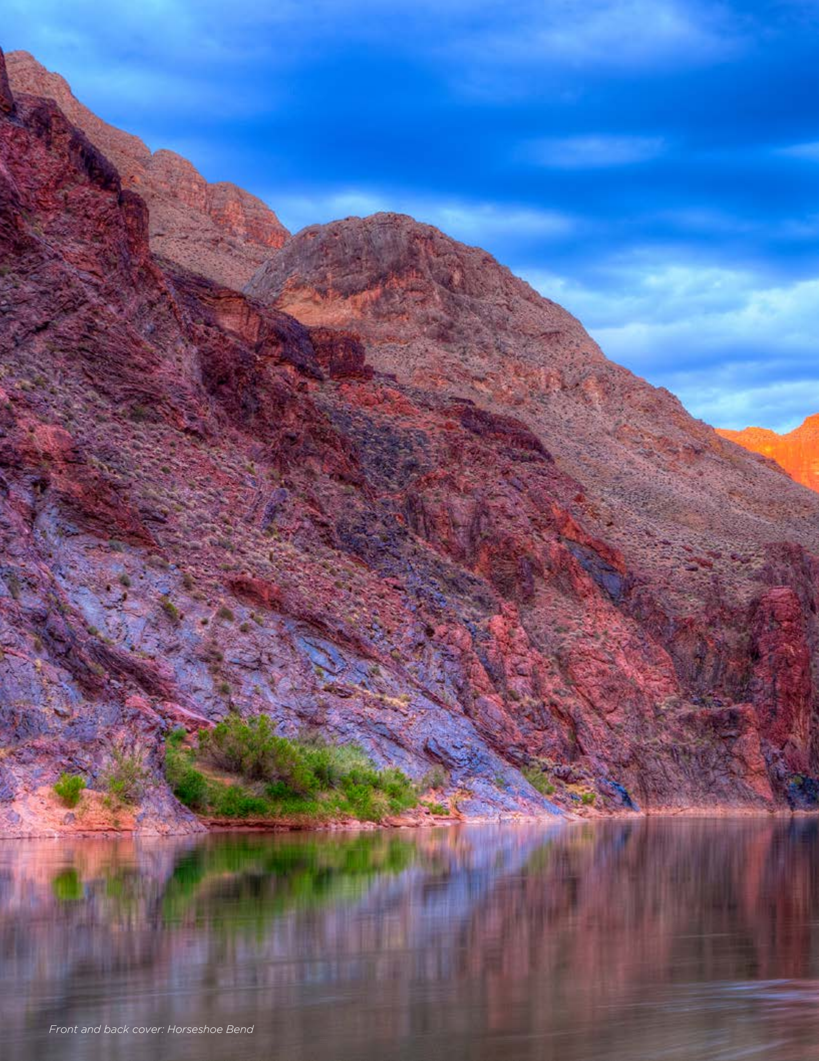
Front and back cover: Horseshoe Bend