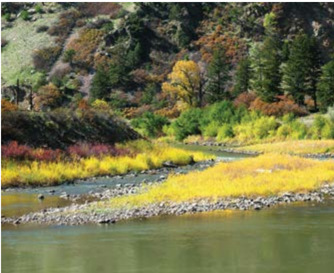
No Name Creek at Colorado River Confluence near Glenwood Springs

Colorado continues to ward off aquatic nuisance species (ANS) with robust boat inspections at popular reservoirs. Inspectors have intercepted more than 145 mussel-infested boats, the majority of which came from Lake Powell. State, regional and local water agencies contributed $1.3 million to the effort, with an additional $3.6 million coming from laws directed to inspection programs that so far have effectively kept ANS out of state waters.