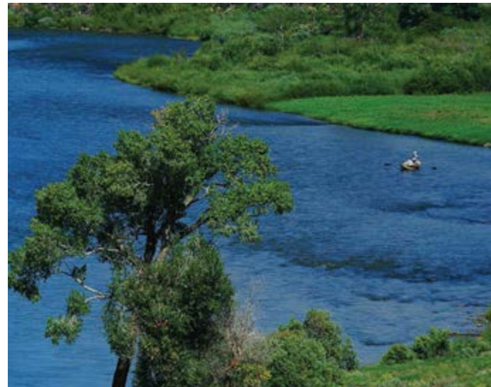
Colorado River at State Bridge, Colorado