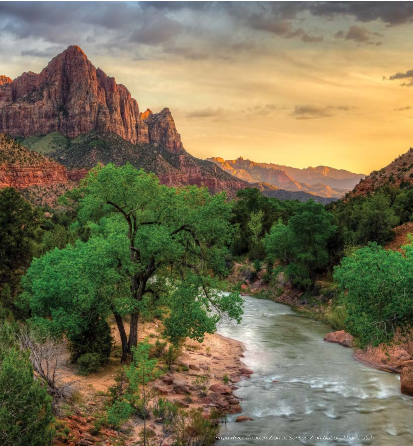
Virgin River through Zion at Sunset, Zion National Park, Utah