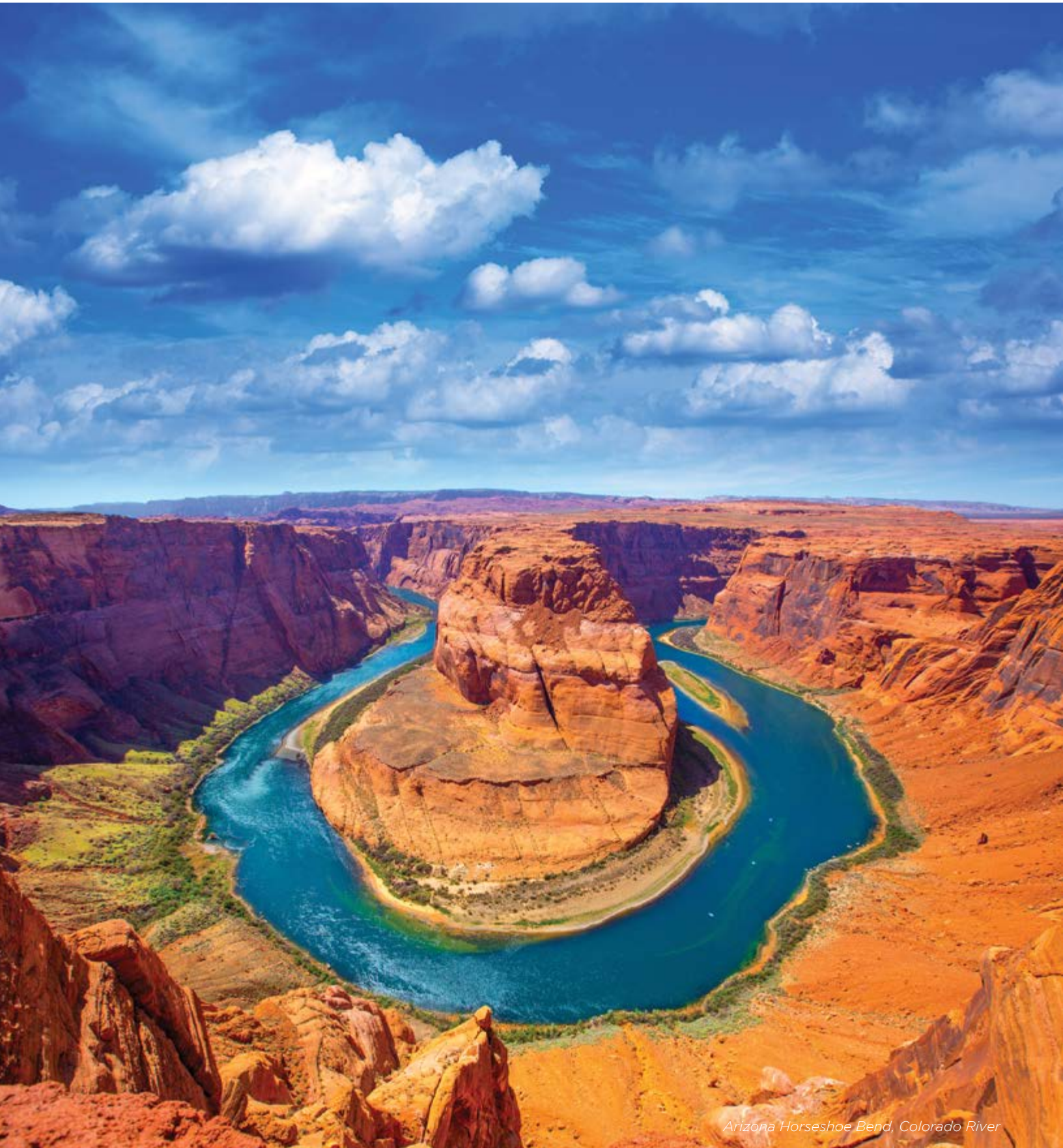
Arizona Horseshoe Bend, Colorado River