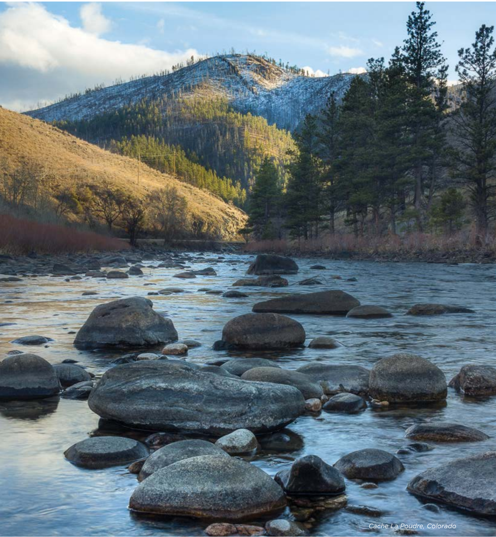
Cache La Poudre, Colorado