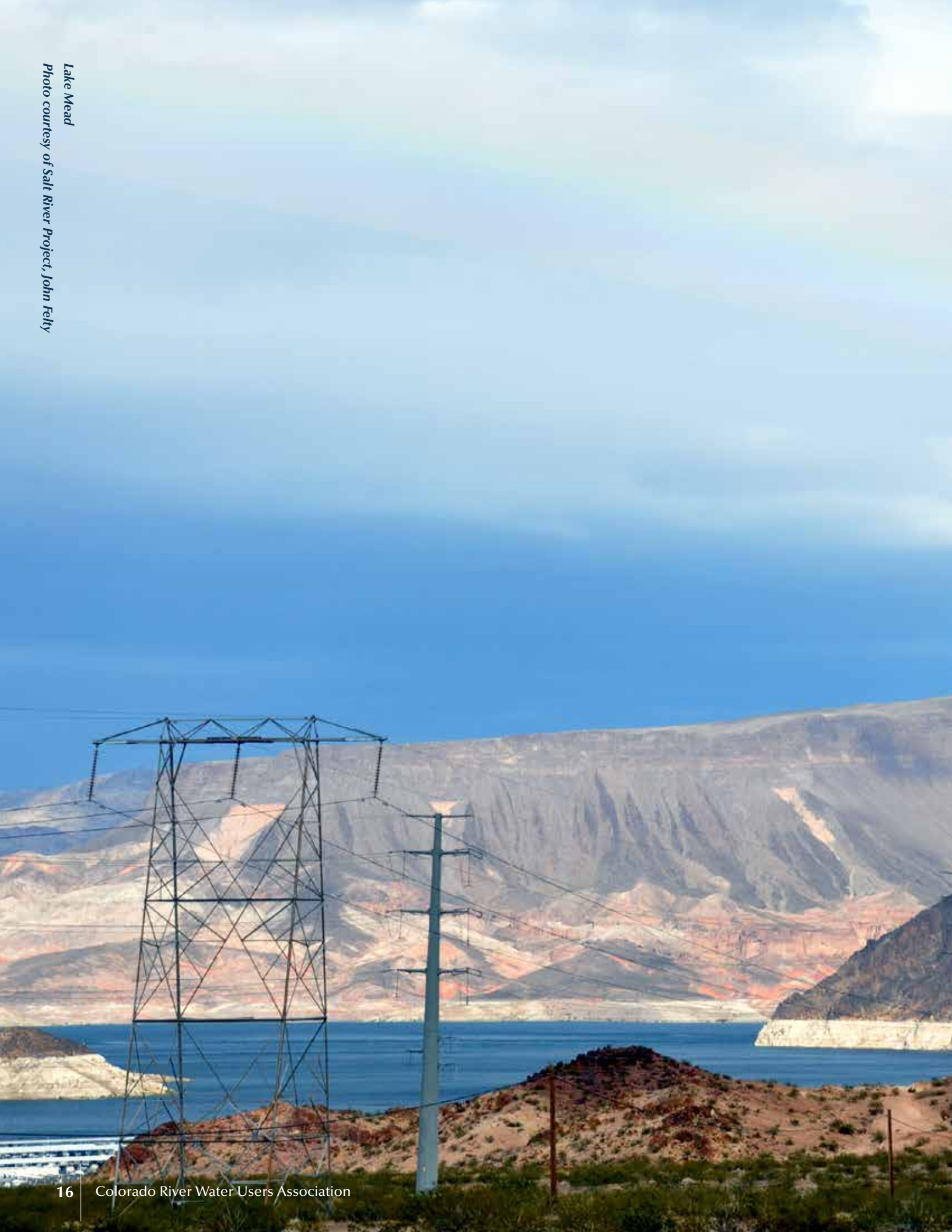
Lake Mead