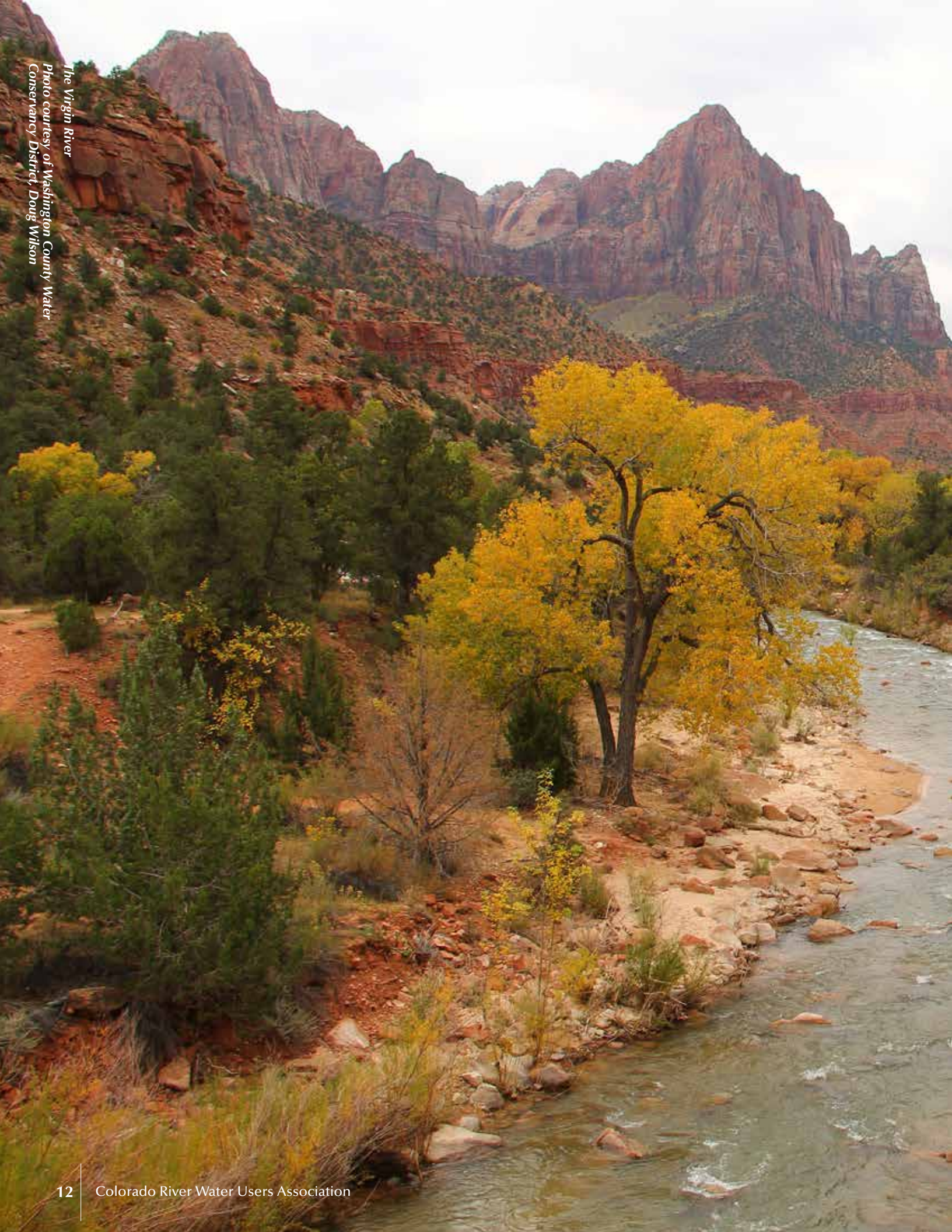
The Virgin River