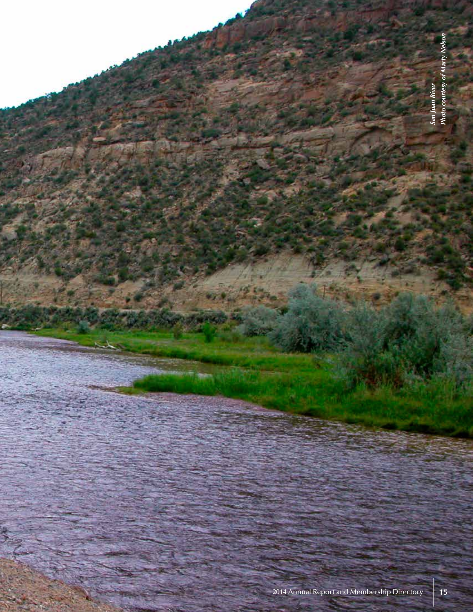
San Juan River