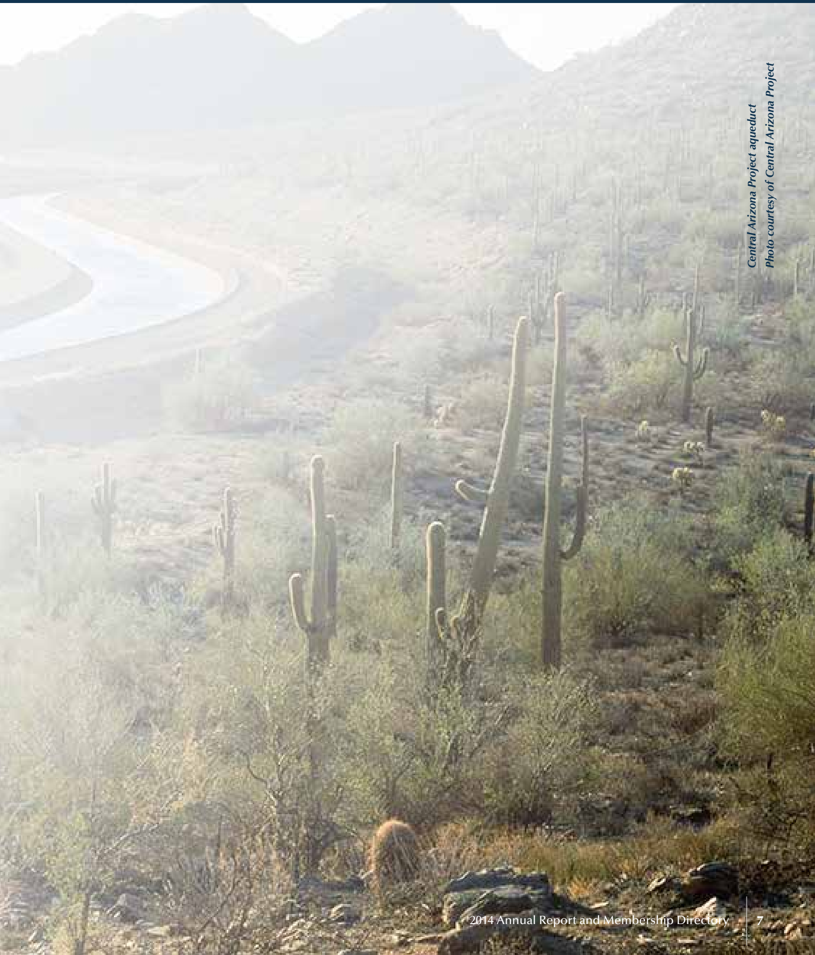
Central Arizona Project aqueduct