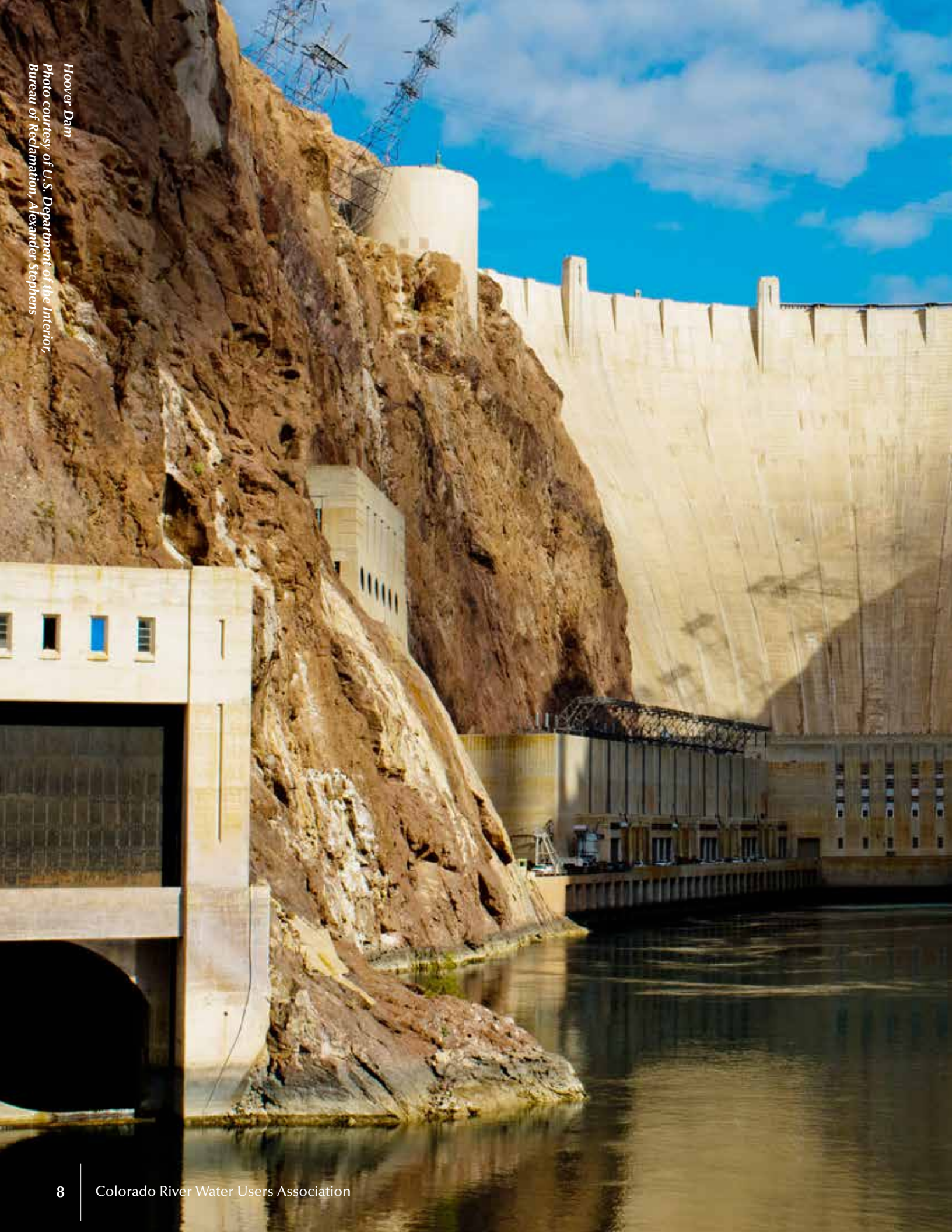
Hoover Dam