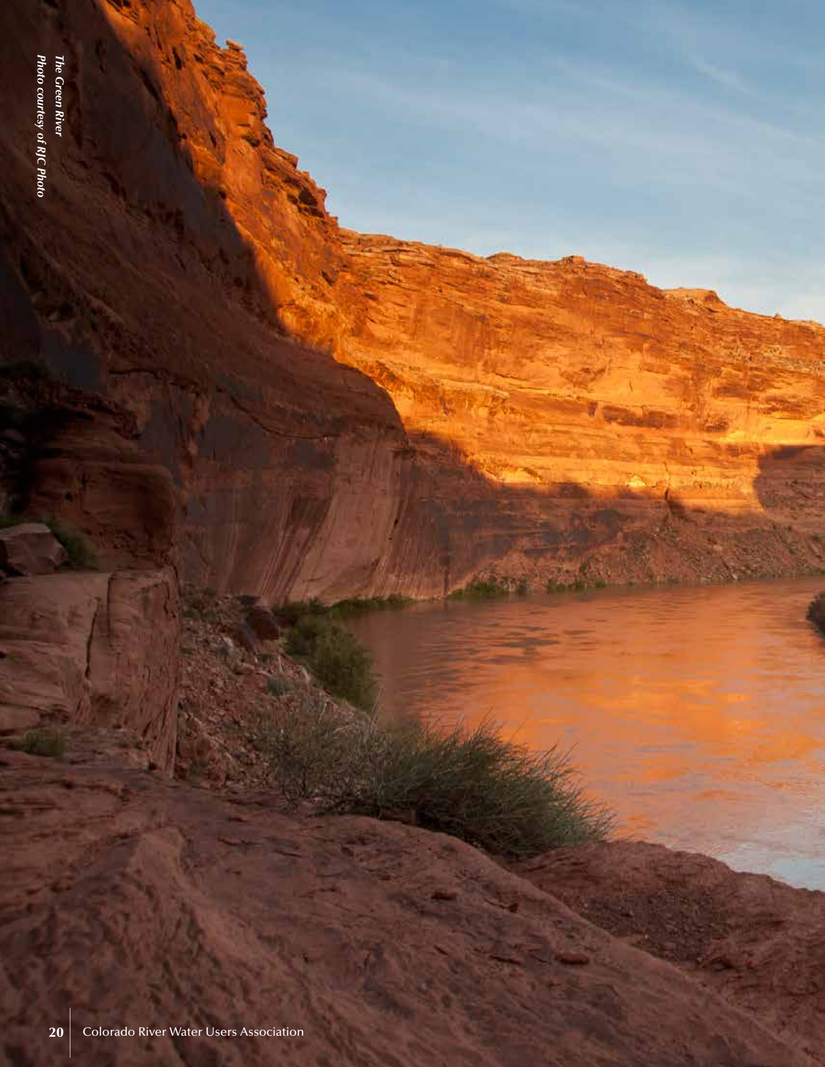
The Green River